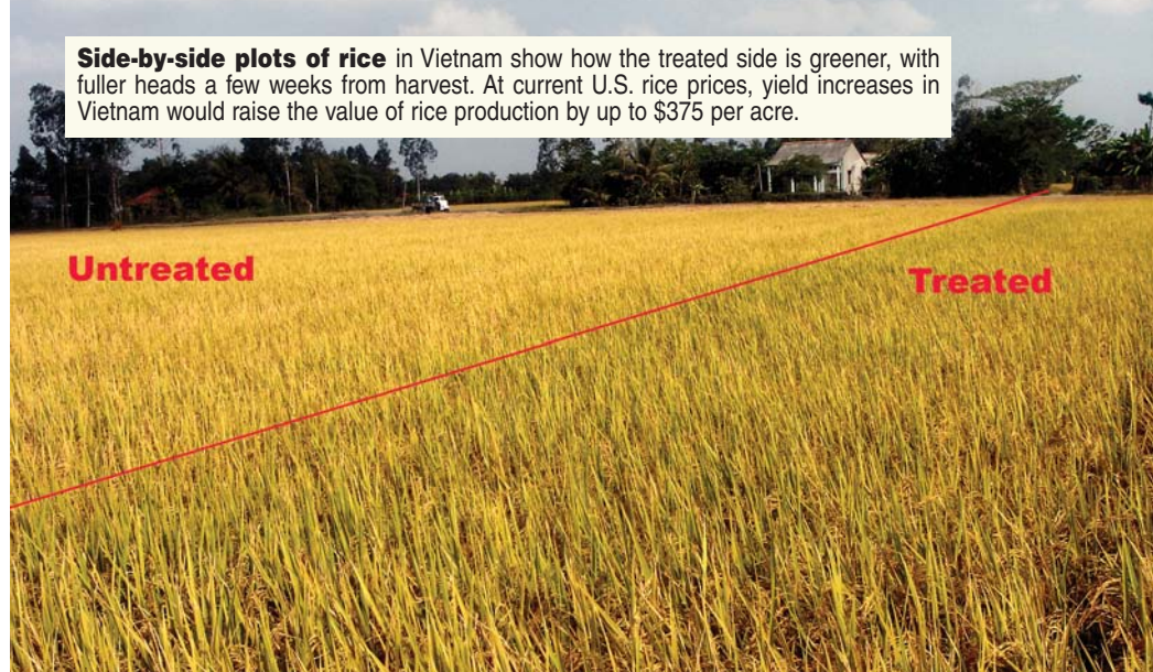
Side-by-side plots of rice in Vietnam show how the treated side is greener, with fuller heads a few weeks from harvest. At current U.S. rice prices, yield increases in Vietnam would raise the value of rice production by up to $375 per acre.

In untreated rice fields, infestations of Rice Blight, Blast and Sheath typically ranged from 35% to 90% of the plants. In SoySoap treated fields, those diseases dropped to just 5% of the plants.